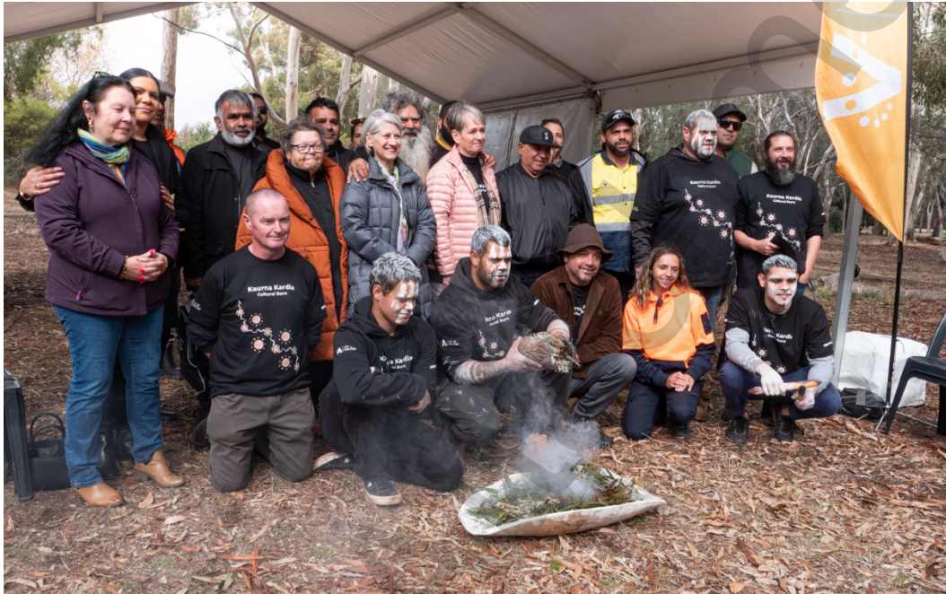
(Partnership between the Kaurna Community and the City of Adelaide)

The Bio-Cultural burn was an historic, moving, joyous occasion. It was the first time Kaurna people were able to publicly practice cultural burning techniques since many of their customs were displaced following European colonisation. It is also the first time a Cultural burn has been undertaken in a capital city in Australia.