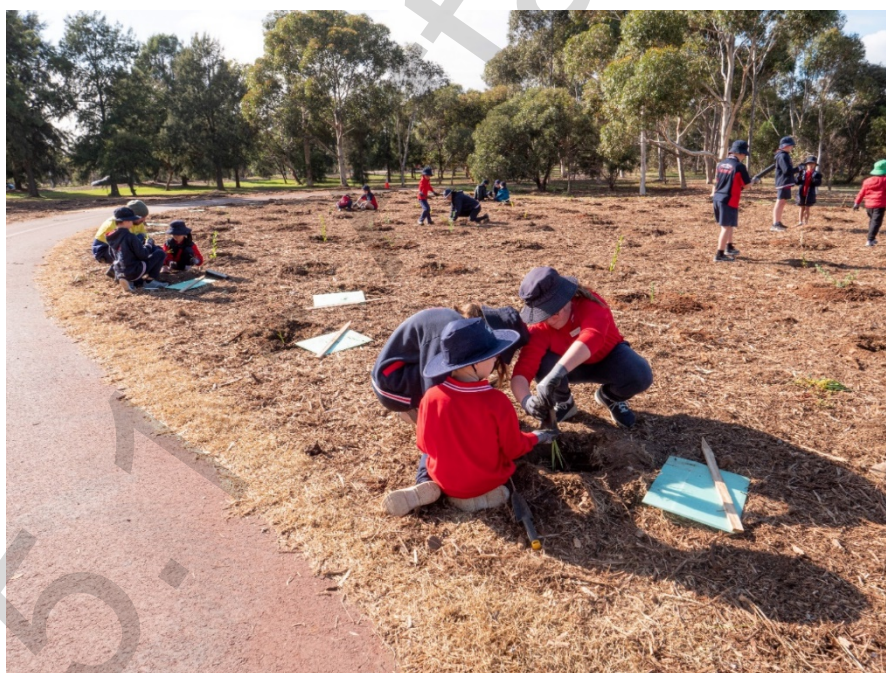
(Students from North Adelaide Primary School)

In May 2021, students from North Adelaide Primary School helped the CoA's Biodiversity Team to plant approximately 575 tube stock. The site will be maintained by the Biodiversity Team and additional species will be planted to improve the quality of the woodland.