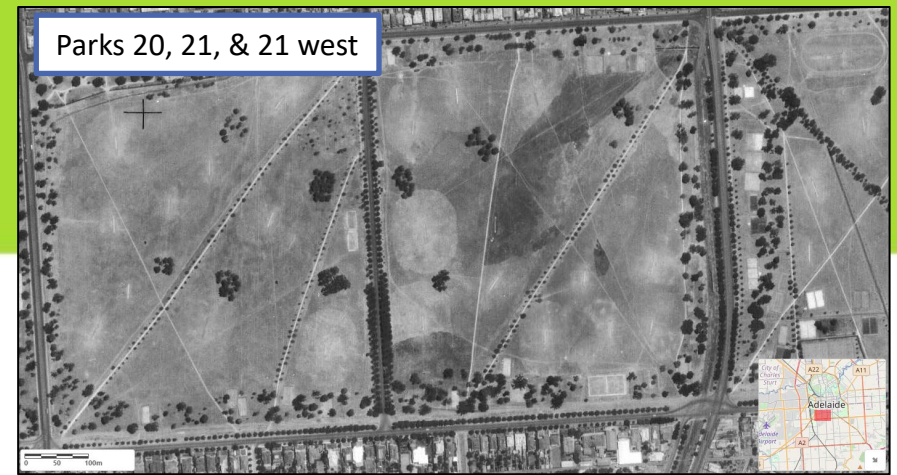
Parks 20, 21, & 21 west