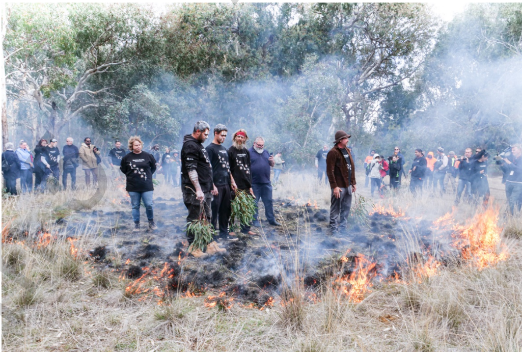
(Kaurna Kardla Parranthi, Carriageway Park / Tuthangga (Park 17))